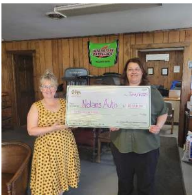
Nolan's Auto Repair