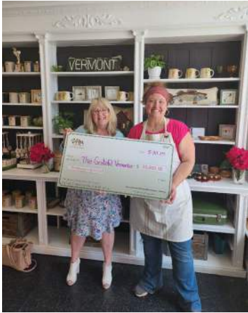
The Grateful Vermonter